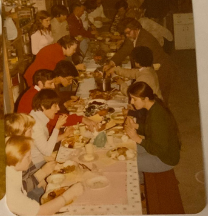
NOV DINER INSIDE SERVICE BAYS