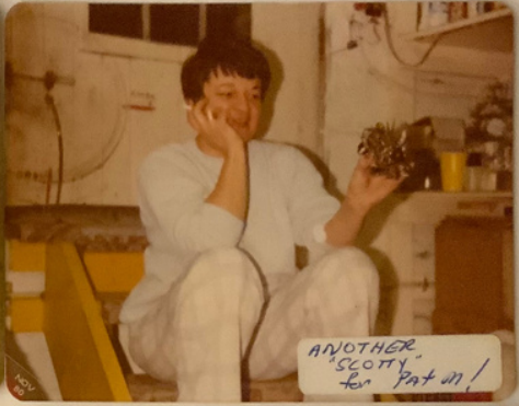
ANOTHER 'SCOTTY' for Pat!!